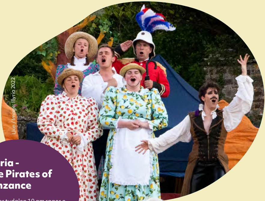
Llun / Image: Illyria 2022

All ticket prices include VAT and are subject to a 10% booking fee (which also includes VAT) where applicable (Booking fees are limited to £3 maximum per cart).